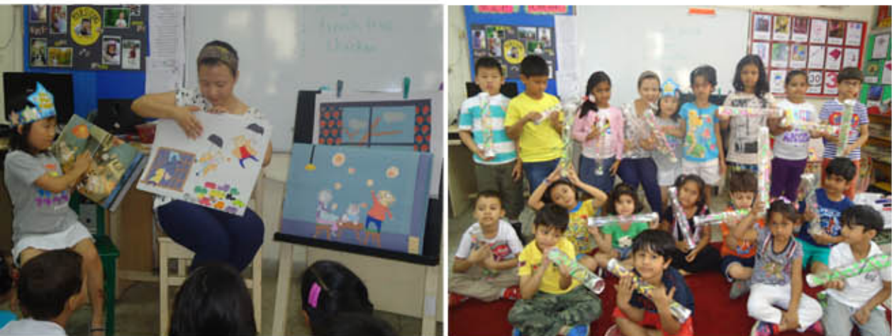
In Upper Nursery A a VIP's mother narrated a beautiful Korean story which she translated in English using illustrations. The story was called "Cloud bread". It was an unusual and fascinating story and took the children on an imaginary trip to the clouds. She also conducted an activity, wherein every child made a sound instrument using plastic, paper and rice grains. The children enjoyed this craft.