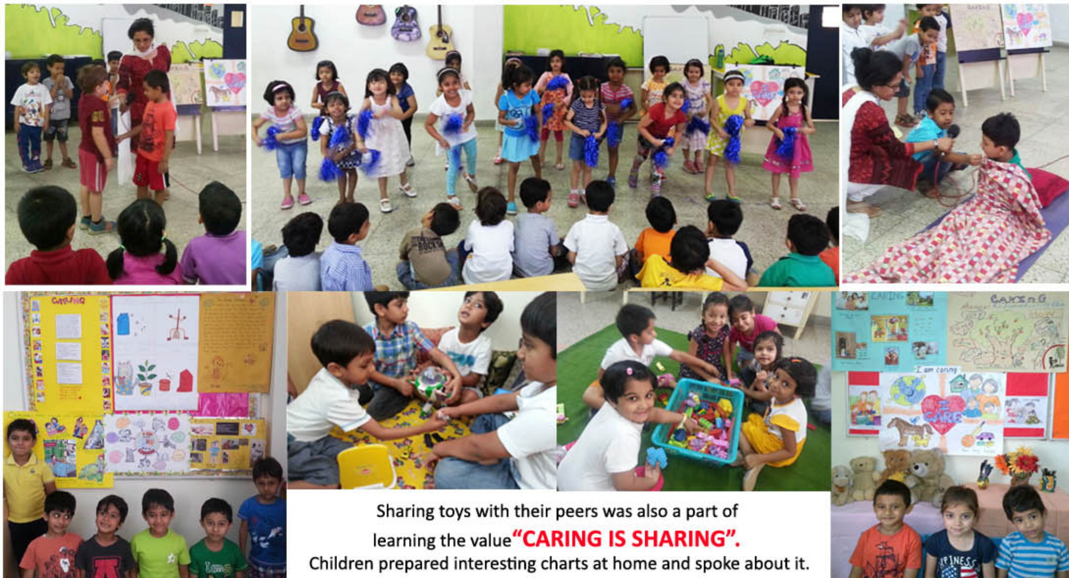
Sharing toys with their peers was also a part of learning the value "CARING IS SHARING" . Children prepared interesting charts at home and spoke about it.

Caring for each other makes our relationships better - For our assembly the girls of Nursery performed a dance on a song called " Caring ". The boys enacted two short skits on taking care of our elders, our friends and our belongings.